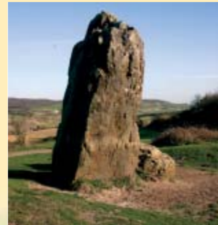
Mottistone Down Long Stone CA