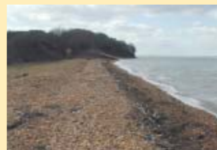
Hamstead Ledge AONB