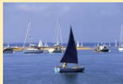
Entrance to Newtown River CA