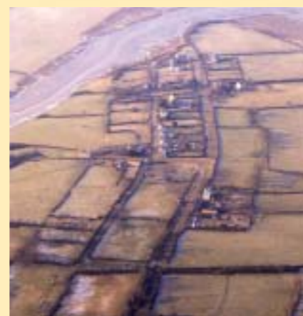
Newtown from the air IWCAHES