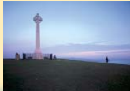
Tennyson Monument CA

● What can we find... Dinosaurs, probably footprints and perhaps ammonites and lobsters further south.