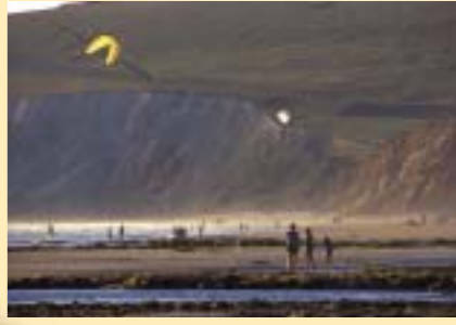
Compton Beach CA