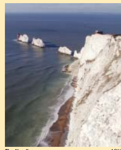
The Needles AONB

● Natural casts of footprints of dinosaurs which lived here 125 million years ago.