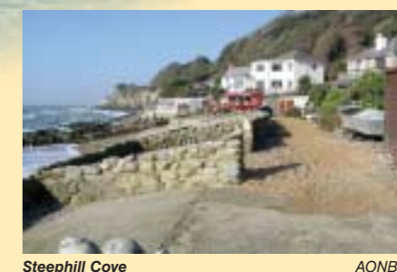
Steephill Cove AONB