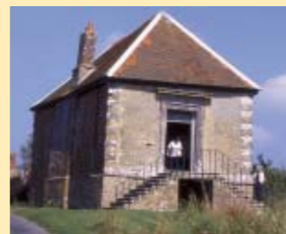
Newtown Town Hall CA