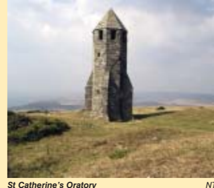
St Catherine's Oratory NT

● Walk through the prehistoric burial landscapes on Afton Down using the Tennyson Trail or visit the Medieval Lighthouse and Oratory for the quiet enjoyment and extensive views of this dramatic coastline.