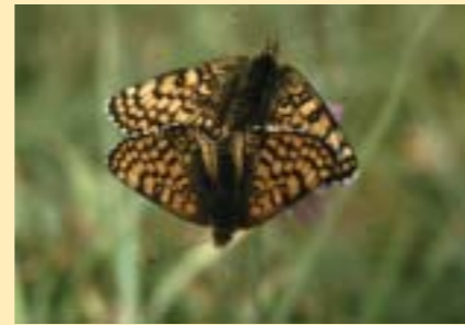
Gianville Fritillary butterflies IWNHAS