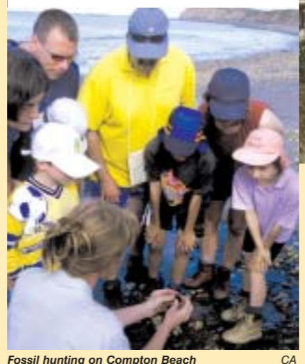
Fossil hunting on Compton Beach CA