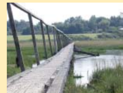
Wooden causeway at Newtown CA