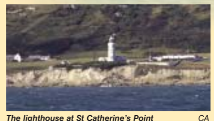
The lighthouse at St Catherine's Point CA