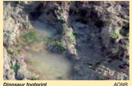
Dinosaur footprint AONB

● Natural casts of footprints of dinosaurs which lived here 125 million years ago.