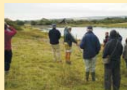
Bird watching walks NT