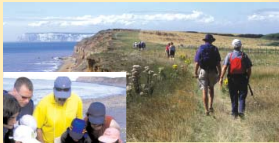
The Coastal Path CA

● From the Palaeolithic (425,000 years ago) to the Bronze Age (4,000 years ago), this Heritage Coast has been used by our prehistoric ancestors who have left huge ceremonial landscapes of burial mounds on the chalk ridge and its downlands. Even the medieval lighthouse at St Catherine's Down was built next to a Bronze Age burial mound. The nearby Medieval Oratory (place of prayer) was built as a place of quiet contemplation of the coastal landscape over 700 years ago.