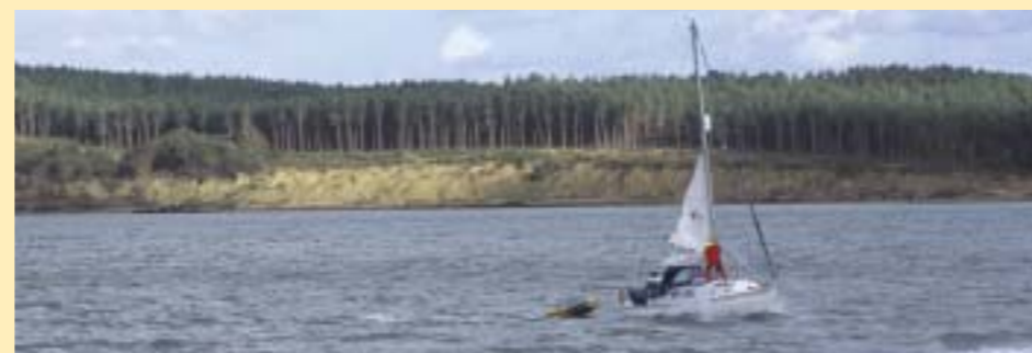
Bouldnor Cliffs CA